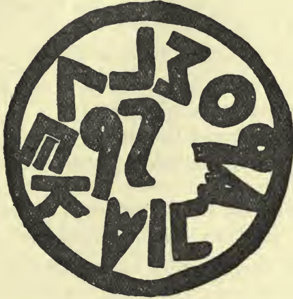
IMPERIAL SEAL OF AUGUSTUS. BERLIN MUSEUM.

In the middle, surrounded by the circle of these letters, there are also the letters \gamma\rho , which we do not understand. Krebs resolves them thus: \gamma\rho(\alpha\phi\epsilon\iota\omicron\nu) ; in that case the seal must also have contained the names of the authorities.